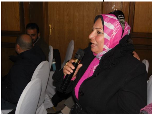
Figure Error! No text of specified style in document.-8: Female participations