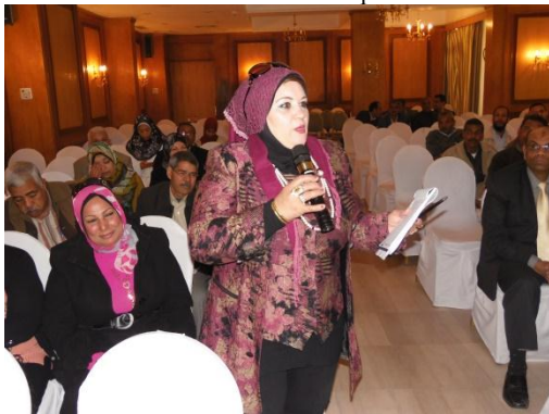
Figure Error! No text of specified style in document.-6: Participants