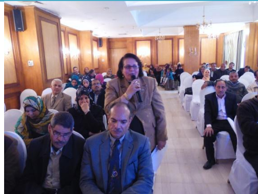
Figure Error! No text of specified style in document.-5: Female participation