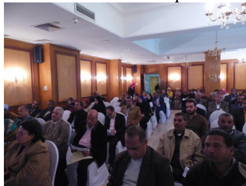
Figure Error! No text of specified style in document.-9: Community people