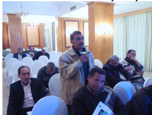
Figure Error! No text of specified style in document.-7: ESIA presentation