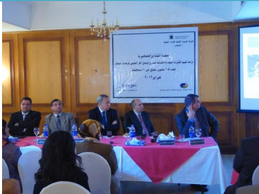
Figure Error! No text of specified style in document.-4: The panel