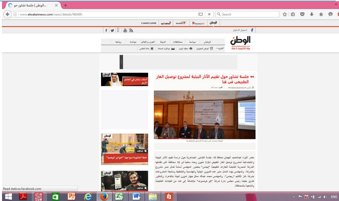
Figure Error! No text of specified style in document.-10: News item in El Watan news