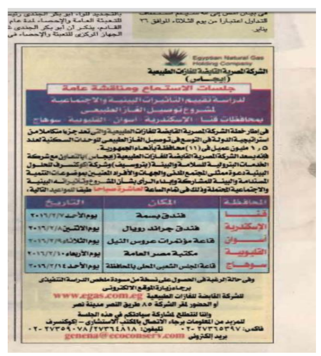
Figure Error! No text of specified style in document.-2:Advertisement published in El Gomhoria newspaper