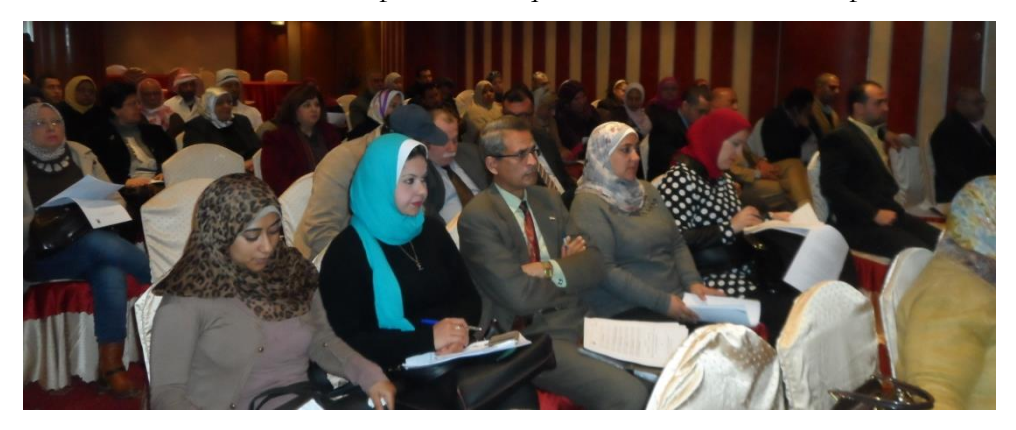
Figure Error! No text of specified style in document.-1:PC Attendees

After the presentations, the floor was opened for comments and clarifications with an equal right for all interested attendees to speak and request clarifications and responses.