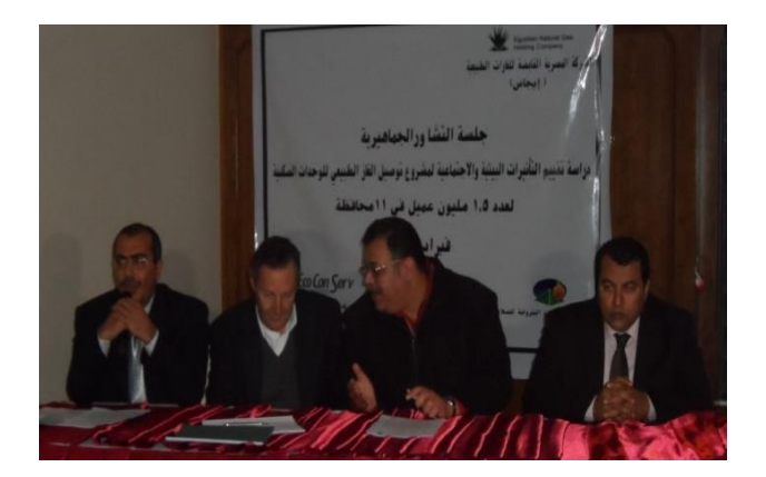
Figure Error! No text of specified style in Figure Error! No text of specified style in document.-8: The panel

The following table describes the detailed discussion and the concerns raised by the stakeholders.