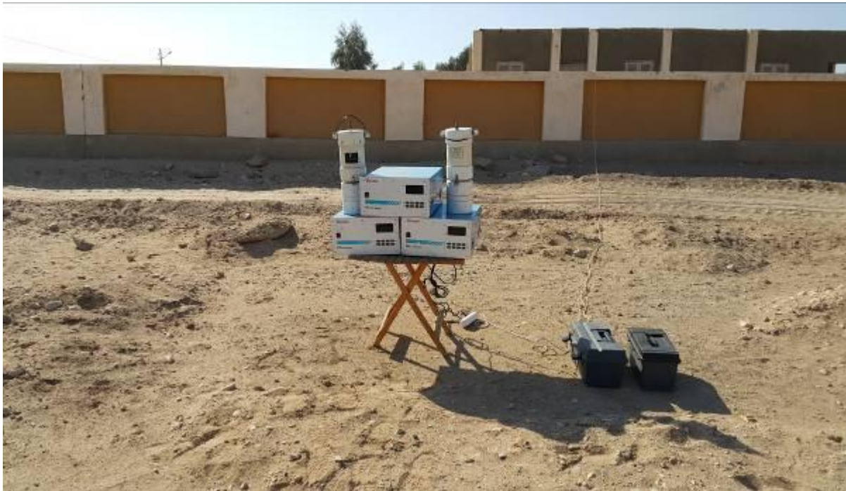
Figure 3-1 ambient air quality monitoring system

Ambient Air Quality Monitoring equipment is an integrated system of which includes several analyzers with data recording devices. A typical system would include gas analyzers for ambient air analysis, data recording, and signal conduction instrumentation.