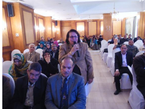
Figure 5: Female participation