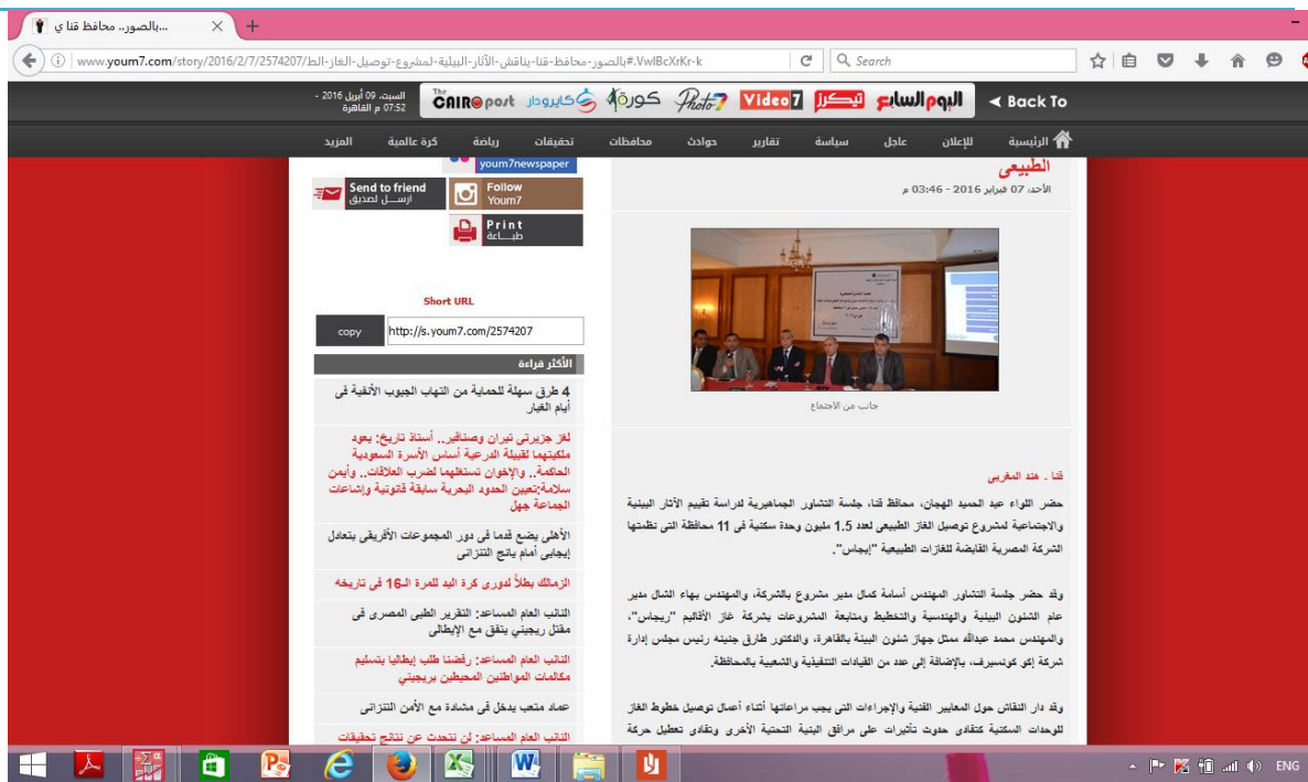
Figure 11: News item in El Youm El Sabea http://www.youm7.com