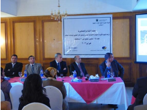
Figure 4: The panel