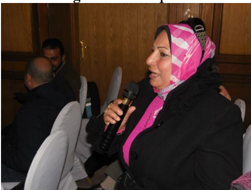
Figure 8: Female participations