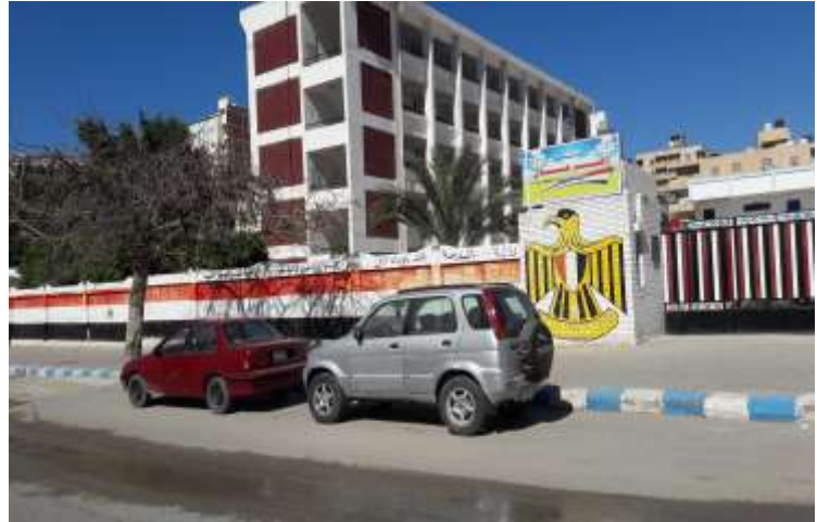
Figure 3-2: A school close to the network in Marsa Matrouh City