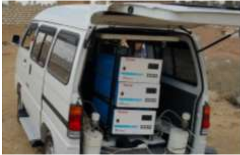
Figure 3-1 ambient air quality monitoring system

Ambient Air Quality Monitoring equipment is an integrated system of which includes several analyzers with data recording devices. A typical system would include gas analyzers for ambient air analysis, data recording, and signal transmission instrumentation.