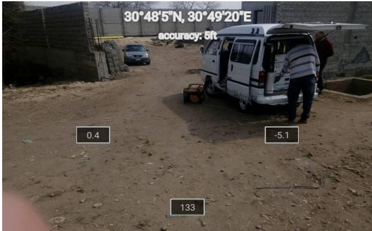
Figure 3-1 ambient air quality monitoring system

Ambient Air Quality Monitoring equipment is an integrated system of which includes several analyzers with data recording devices. A typical system would include gas analyzers for ambient air analysis, data recording, and signal transmission instrumentation.